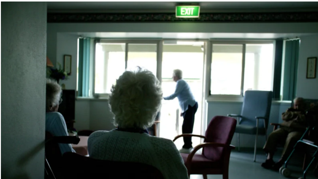
Residents at Earle Haven Retirement Village have an uncertain future.

Operator HelpStreet Group was removing equipment and fridges from Earle Haven Retirement Village and only a few staff remained at the site on Thursday afternoon, a Queensland Health spokeswoman said.