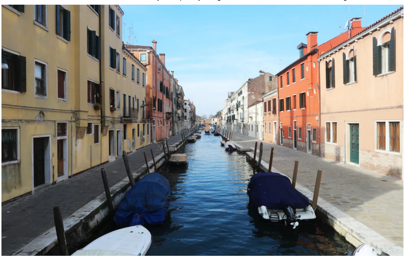
Venice is completely empty after the government suspended all normal economic activity to fight the coronavirus