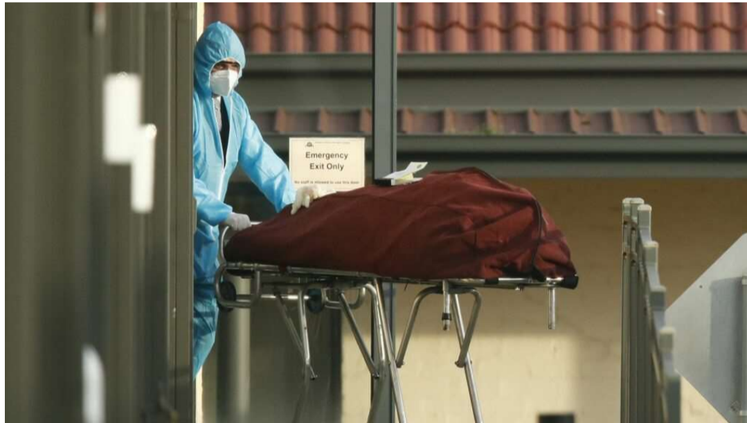
Image of a body removed from St Basil's Homes for the Aged in Fawkner, Melbourne back in July 2020.

More heartbreaking reports coming out of St Basils' inquest